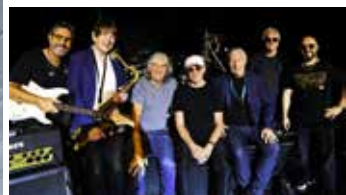
Dire Straits Legacy, plus Deacon Blues