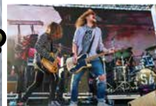
Soul Asylum, plus Stone Type Thing