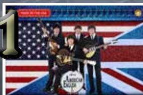
American English, plus Mac Attack