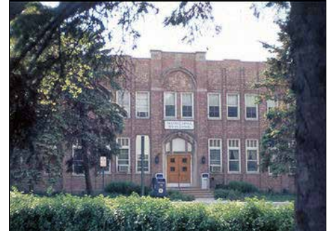
Addison Municipal Building, the former Kinderheim, before the address was changed to 131 W. Lake St.

In November of that year, the Village hired O'Donnell, Wicklund, Pigozzi and Peterson to conduct a project feasibility study. The conclusion of the study was that it would be more cost effective to build an entirely new building, and by the following September, the decision to tear down the 73-year-old structure was finally made.