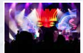
Lateralus, plus The Buzz Worthys